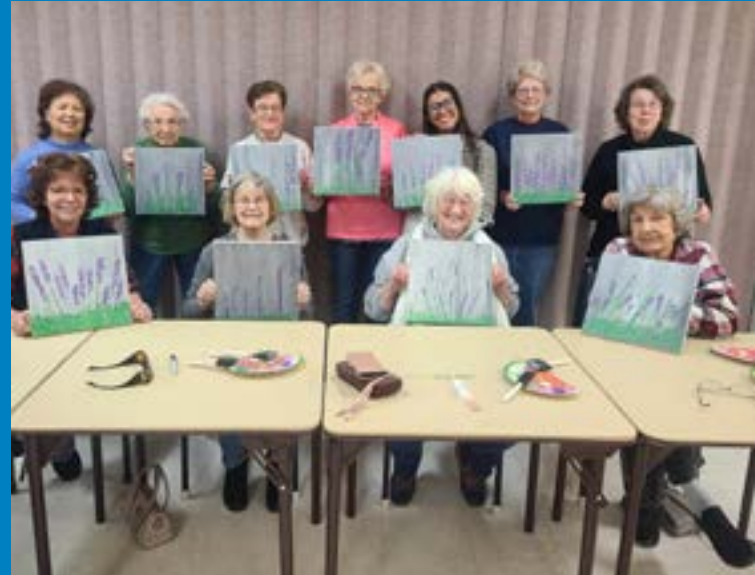
Recreation Pages 2-5